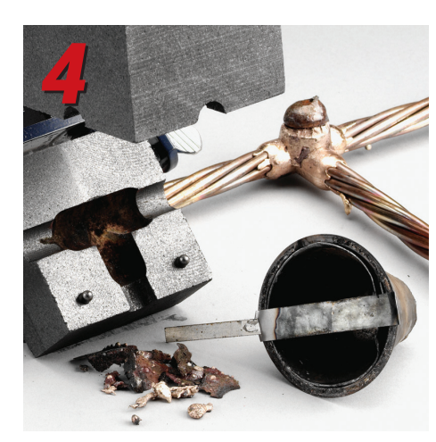
Open the mold and remove the expended steel cup - no special disposal required

Cadweld Plus Control Unit initiates the reaction of the metal crucible. The standard unit includes a 6-foot (1.8 meter) high temperature control unit lead. The lead attaches to the ignition strip using a custom made, purpose-designed termination clip.