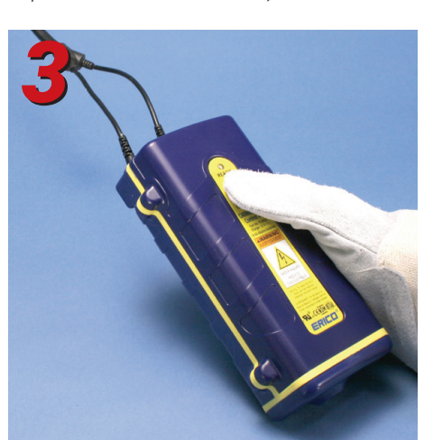
Press and hold control unit switch and wait for the ignition