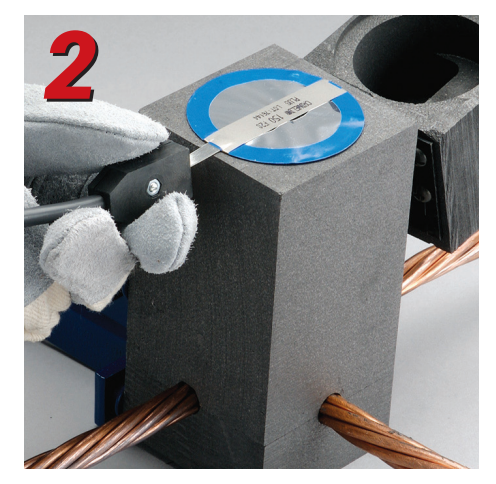
Attach control unit termination clip to ignition strip