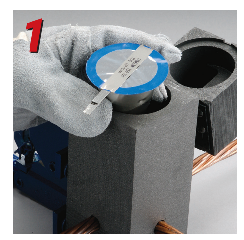
Insert Cadweld Plus cup into mold (may require use of a cover/baffle)