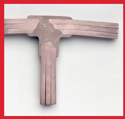
The Cadweld molecular bond will last the lifetime of the conductors.